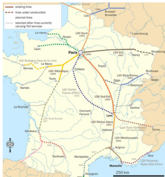
Principle domestic TGV routes in France

Mr. Roth pointed out that the Paris-Lyon line imperial (PLM), commuting 40% of the French population, was struggling with the capacity and speed problems. To overcome these problems, Mr. Roth explained the solution of constructing a completely new Paris-Lyon Sud-Est route (LGV- ligne à grande vitesse). This new route can ascend excessive gradients at unimaginable speed, leaving behind the need for tunnels, and eventually will reduce costs.