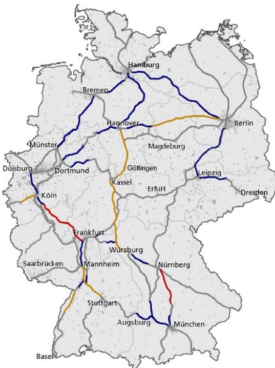
ICE network and allowed speed