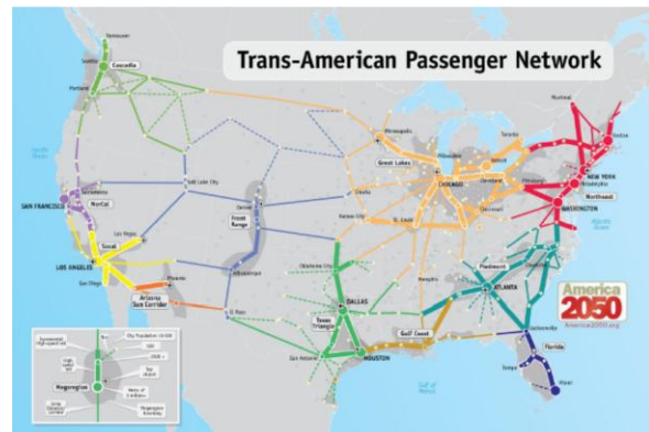
Trans American Passenger Network