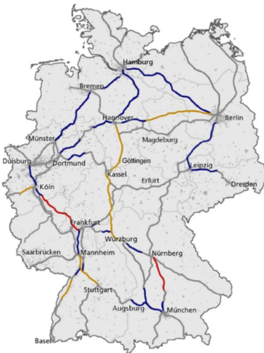
ICE network and allowed speed