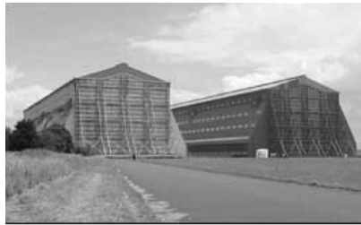
Figure 3 Cardington Airship Sheds

The crash of the R101 ended the British passenger airship program, but the “sheds” continue to be used to this day. These hangars were critical to the construction of the SkyShip 600 airship series. Most recently, Hybrid Air Vehicles (SkyCat) have used the British airship hangars to develop and test their prototypes.