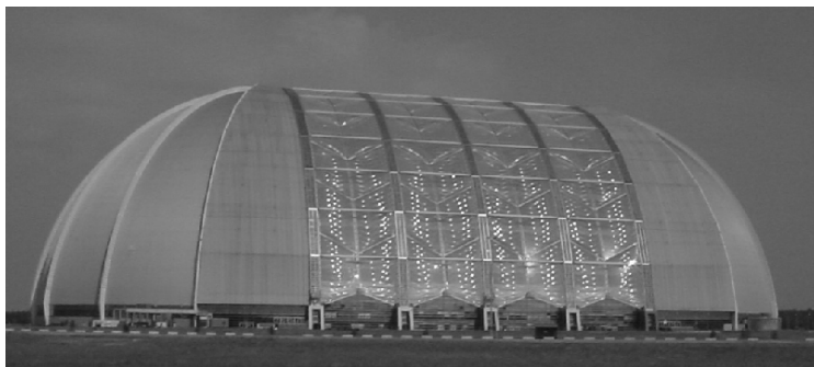
Figure 6 CargoLifter Hangar, Brandt, Germany, circa 2005

The world's newest and largest airship hangar was completed in November 2000 for the German company, CargoLifter. Following the bankruptcy of this venture, this hangar was converted into a