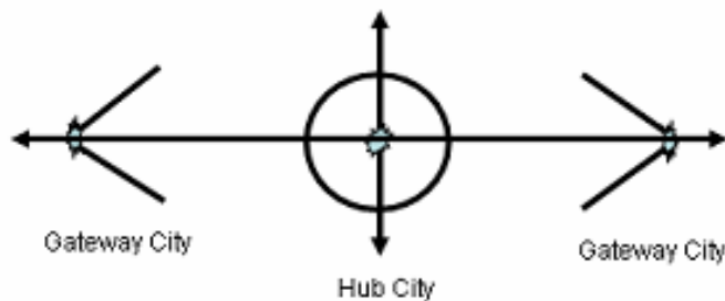
Figure 1 Hubs and Gateways on a Trade Corridor

Traffic is funneled through a gateway city because it sits at a strategic location where transportation costs can be minimized along a land corridor or a sea route. Ocean ports are obvious gateway cities. Vancouver serves as a gateway to the Asia Pacific trade routes and